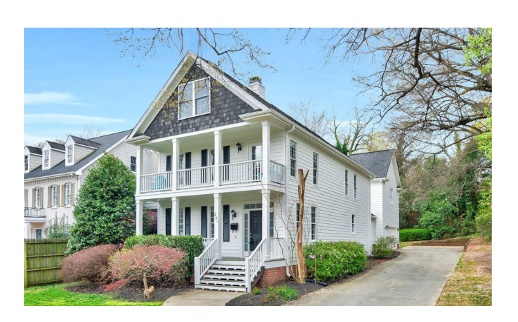
NC State Study Center 20I Brooks Ave, Raleigh, NC 27607 www.ncstatestudycenter.org