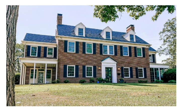
East Carolina Study Center 500 Elizabeth Street, Greenville, NC 27834 www.ecstudycenter.org