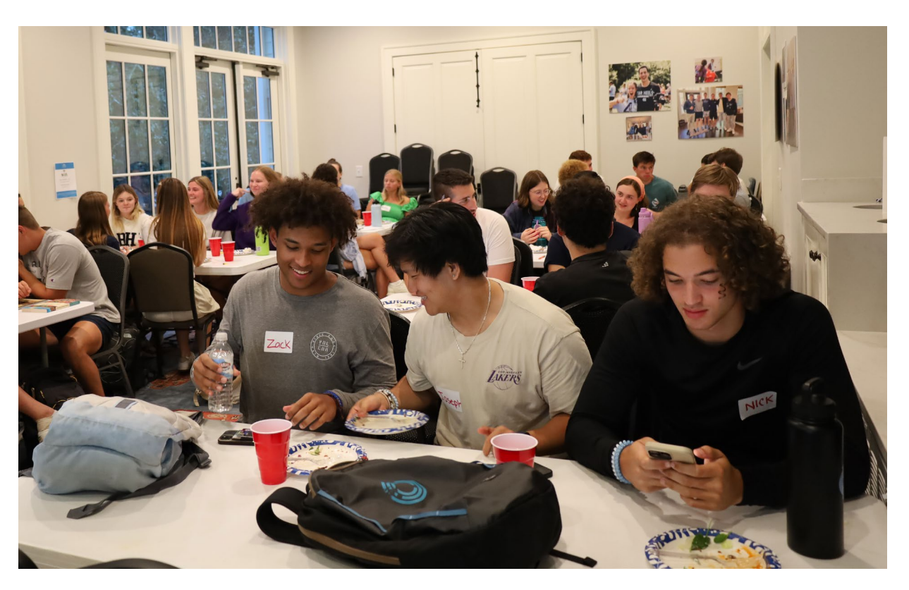
UNC-CH students participating in The North Carolina Study Center's Fellows Program, which offers instruction classes in scripture and theology designed to equip students with the knowledge, tools, and community necessary to deepen their faith and connect it to all of life.

As we invest in student leaders, they can mature rapidly and then hopefully discover all kinds of opportunities to make a difference on campus."