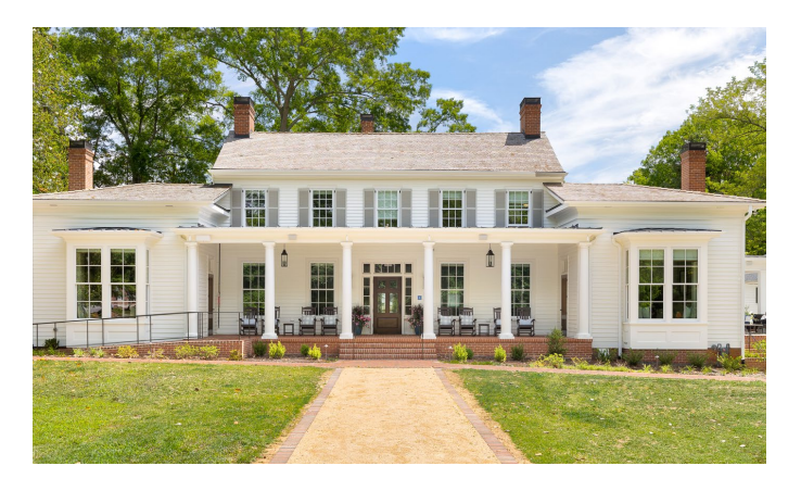
North Carolina Study Center 203 Battle Lane, Chapel Hill, NC 275I4 www.ncstudycenter.org