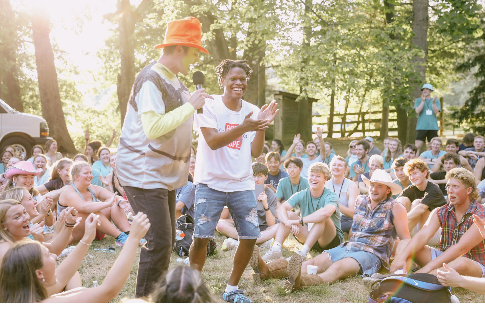
Students at Carolina Way Camp, a first-year orientation experience in North Carolina for incoming freshmen who know or are seeking to know Jesus Christ