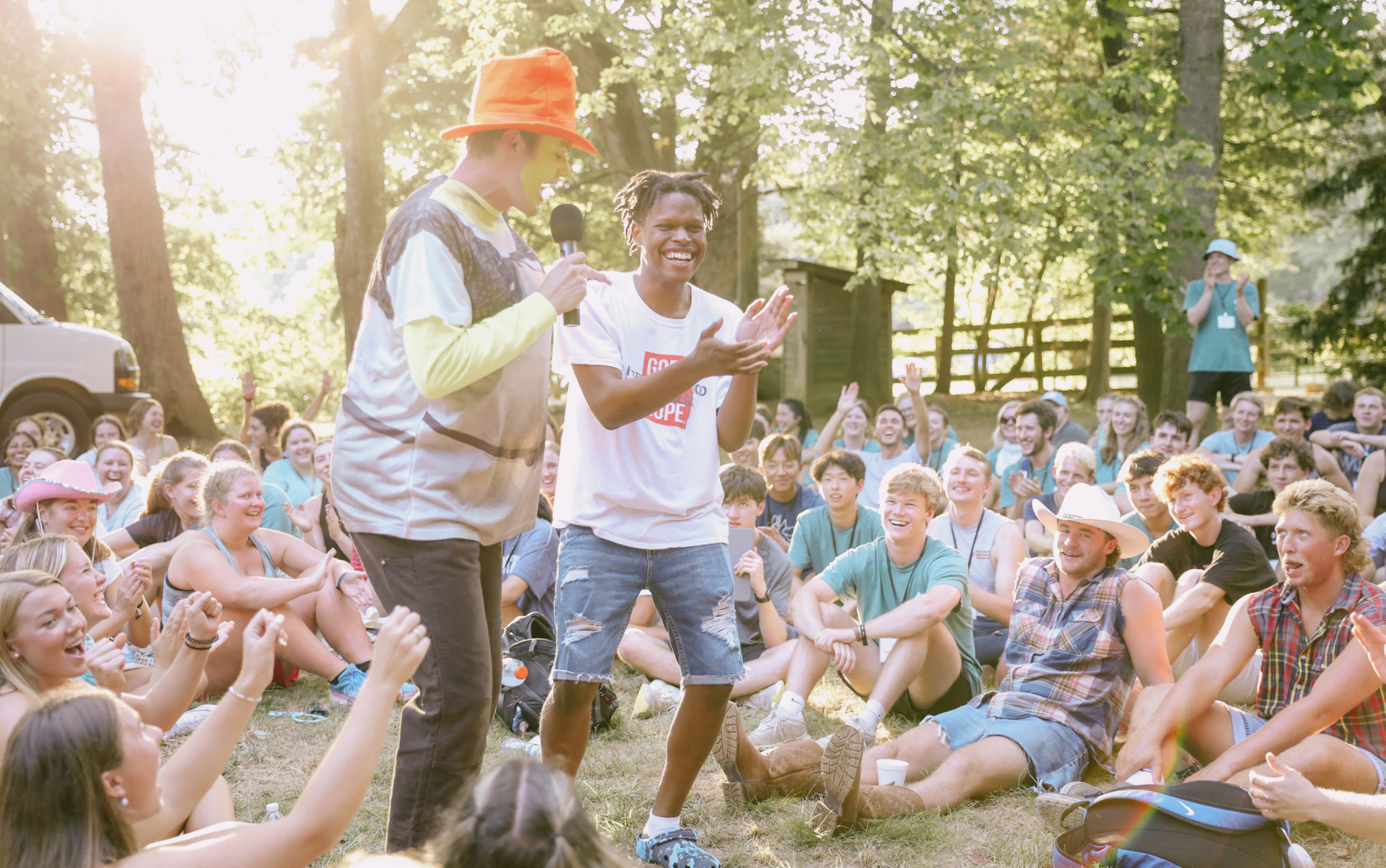
Students at Carolina Way Camp, a first-year orientation experience in North Carolina for incoming freshmen who know or are seeking to know Jesus Christ