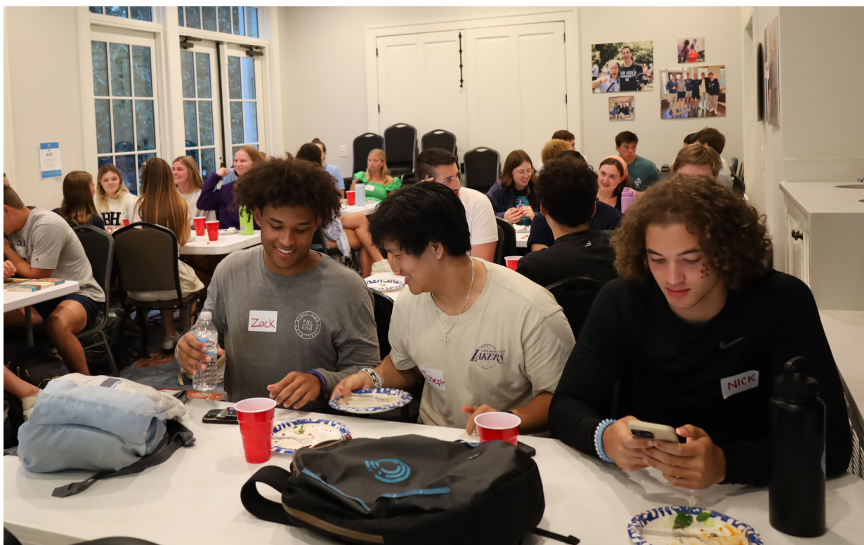
UNC-CH students participating in The North Carolina Study Center's Fellows Program, which offers instruction classes in scripture and theology designed to equip students with the knowledge, tools, and community necessary to deepen their faith and connect it to all of life.

As we invest in student leaders, they can mature rapidly and then hopefully discover all kinds of opportunities to make a difference on campus.”